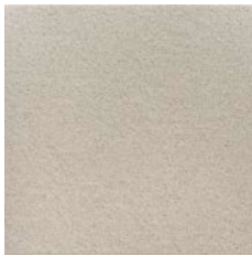
QUARTZ LRV 37 300 x 300 DW-TXQUZ3030