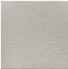
STEEL GREY LRV 35 300 x 300 DW-TXSGR3030